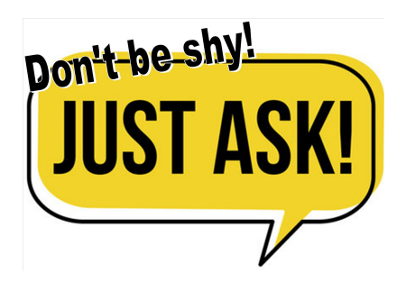
Ask and you shall receive. People Prospering People!

Do you need something? Do you have something to offer? Let us know! <u>churchoffice@unityoffoxvalley.org</u>